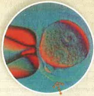
Micro-injection of a sperm cell into an ovum with a pipette (ICSI).